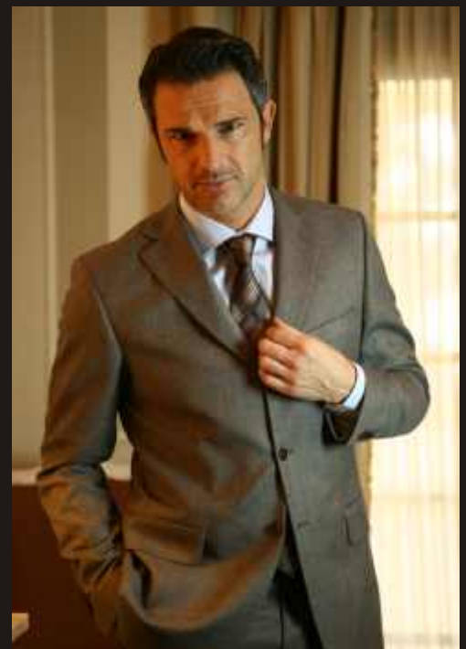
CADINI Fall/Winter '08-'09 collection

Ultimately, the shirt cuff attracts the eye, making one's arms appear long and limber.