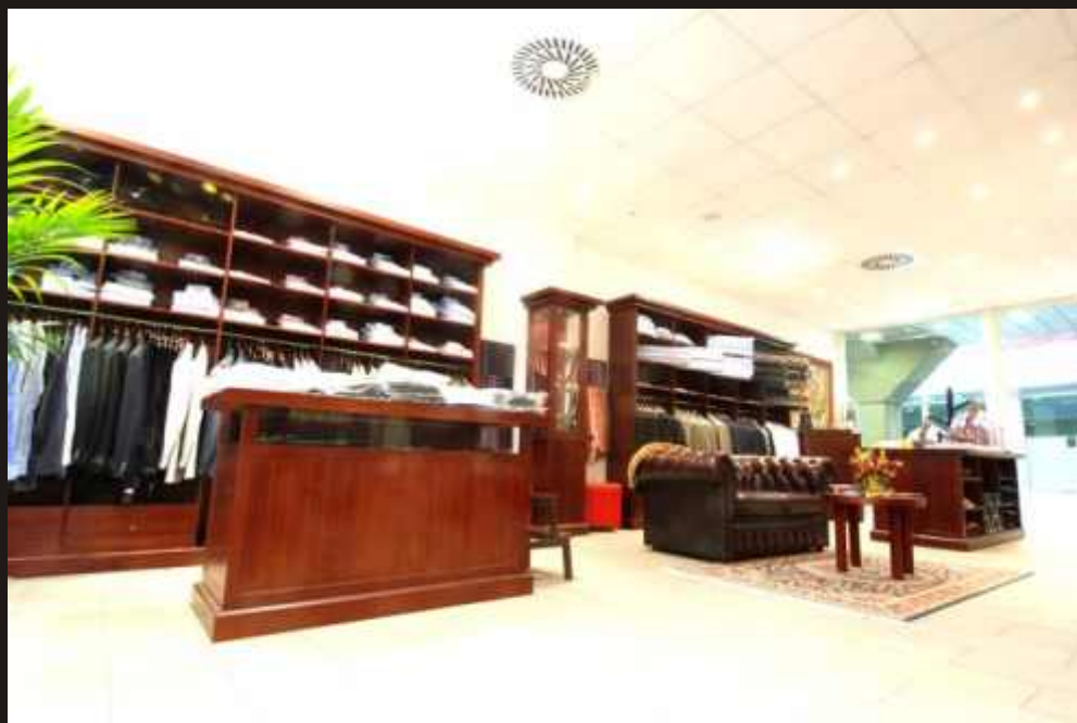
Interior of the CADINI STORE in via Gioberti, Florence

CADINI HAS OPENED ONE MORE STORE IN FLORENCE, TOGETHER WITH THE RE- LOUNCH OF THE MADE-TO-MEASURE PROJECT